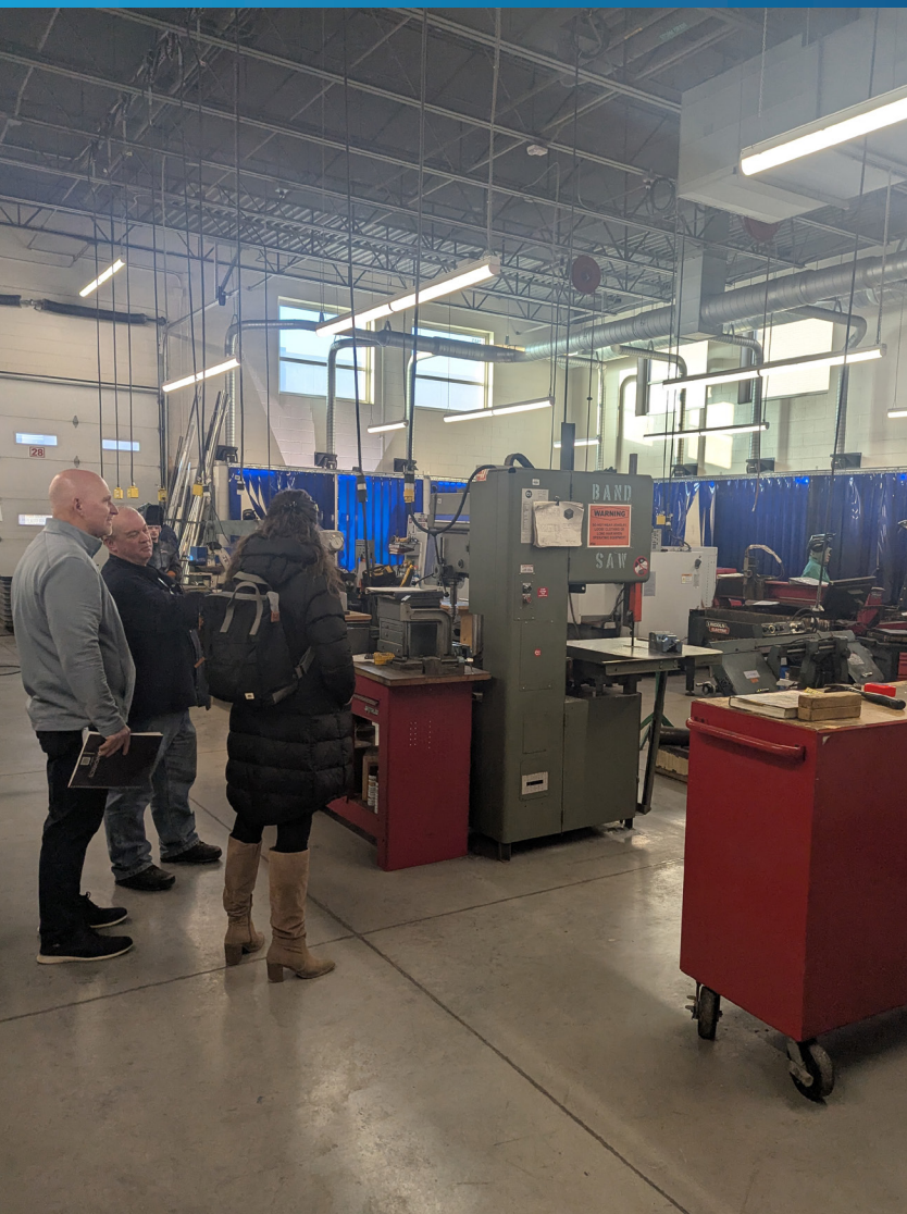
SASD staff touring Kewaskum MS/HS