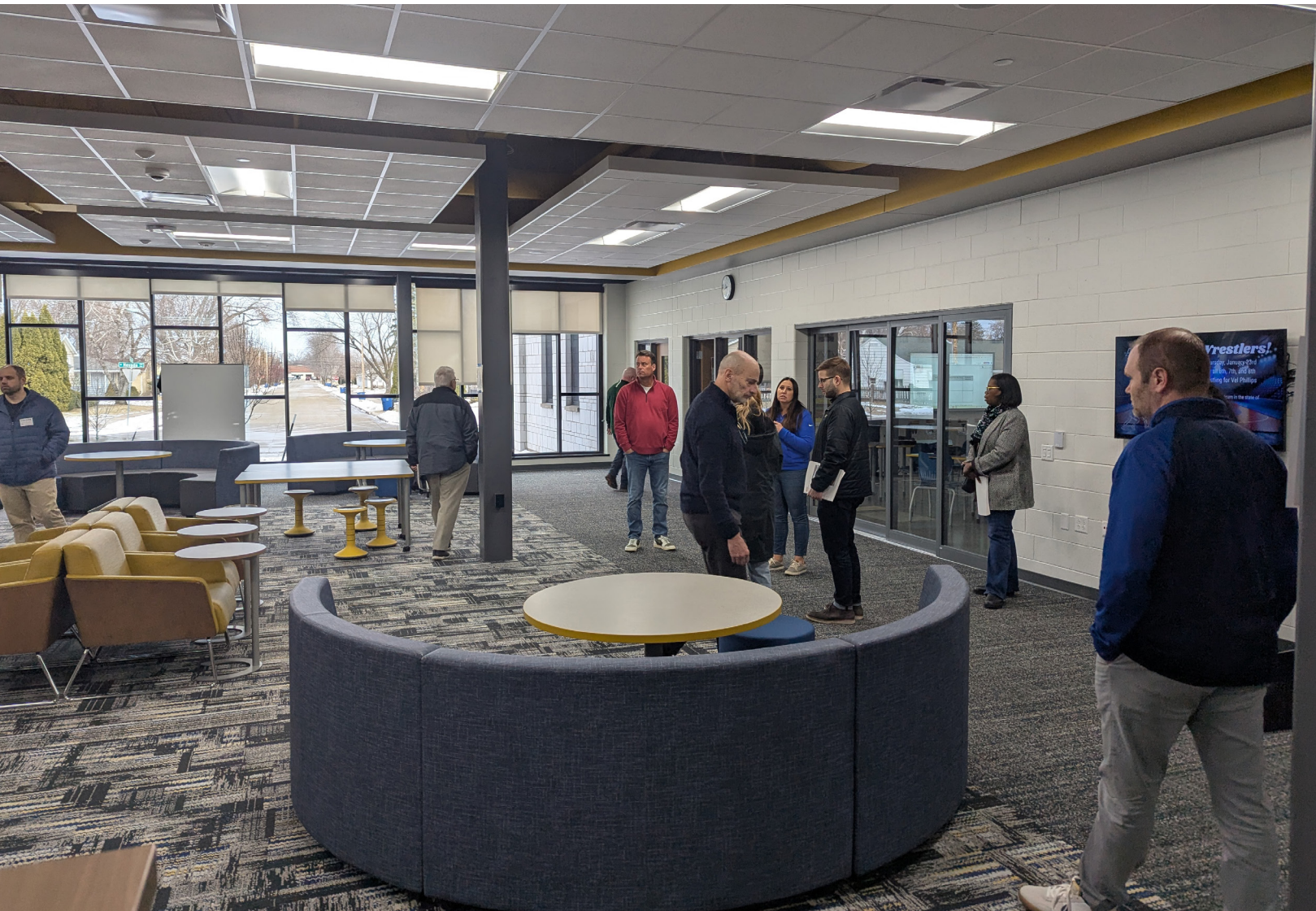
SASD staff touring Vel Phillips MS in Oshkosh