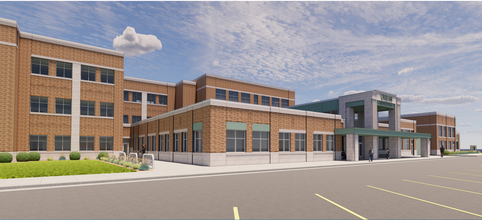
Preliminary Rendering of Urban on the West Facade