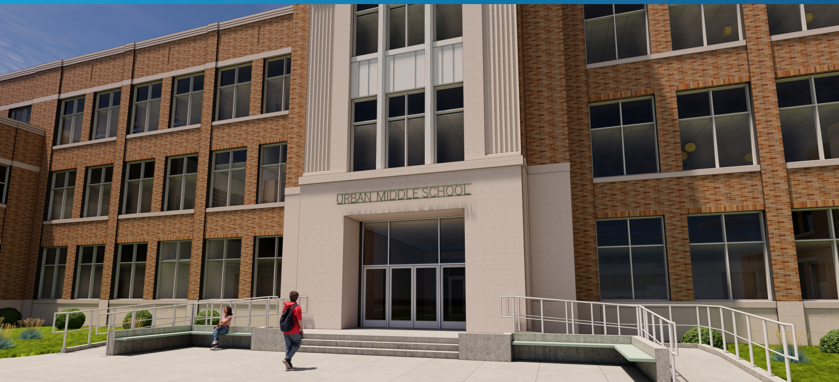
Preliminary Rendering of Urban at Existing Main Entry