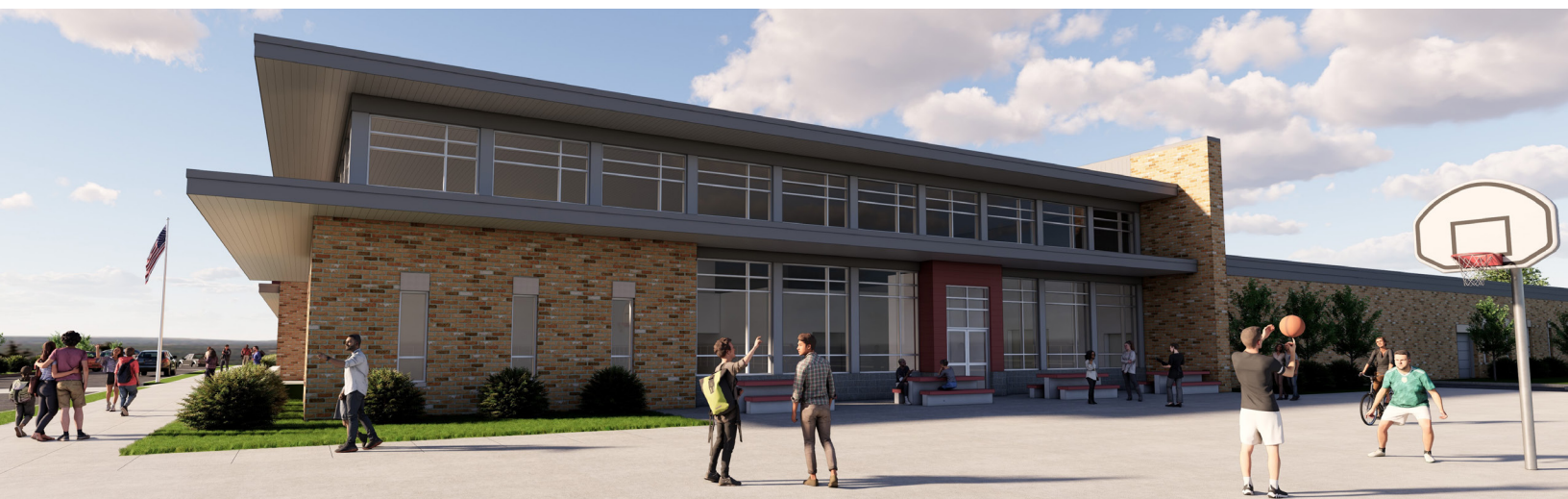
Preliminary Rendering at Farnsworth Cafeteria

Meanwhile, the interior architecture and design team is working closely with engineering to create engaging, welcoming spaces that support student learning and empower staff. In the coming months, we look forward to sharing preliminary interior renderings that offer a first look at how these future spaces will take shape.